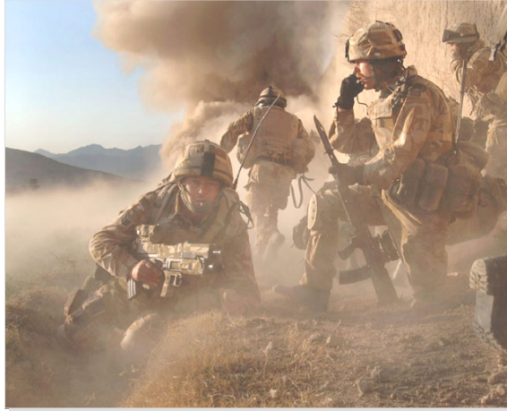
SOLDIERS IN THE BATTLE FIELD IN IRAQ

Friday July 31 2009 entered the annals of history as the day the last contingent of British Soldiers withdrew from Iraq. The war in Iraq (code named by former US President George W. Bush and his Coalition of the willing as "Operation Iraqi Freedom") has claimed the lives of more than two thousand US troops and over 150 British Soldiers and left many more wounded. While most of these casualties resulted from assaults from enemy combatants, a few of them came from what has been termed "friendly fires". What are "friendly fires"? It is a military expression which refers to incidents incurred by individual soldiers, group of soldiers or an army detachment, perpetuated accidentally or unintentionally by forces from their own camp. It may be a stray bullet from a colleague or a missile mistakenly fired on the plane of a military pilot by a fellow soldier.