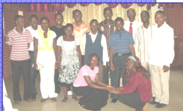
Members of CYJ Limbe with the NC and Regional Coordinator South West