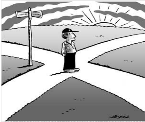
Which way will you take when you reach life's crossroads

However, it is important to underscore here that God dwells beyond the confines of human consciences. He is far above and has always maintained His sovereignty over human standards, values and way of life. God declares unequivocally in His word that "For my thoughts are not your thoughts, neither are your ways my ways, saith the LORD. For as the heavens are higher than the earth, so are my ways higher than your ways, and my thoughts than your